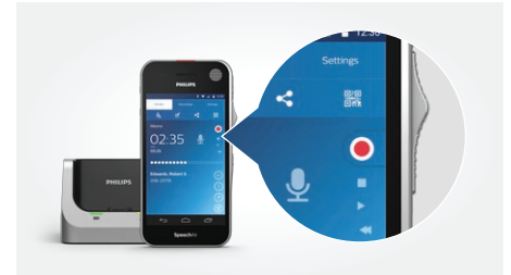
SpeechAir Smart Voice Recorder