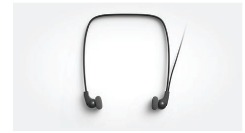
Lightweight, under-the-chin-style stereo headphones designed to deliver excellent sound quality, with soft ear cushions for enhanced wearing comfort.